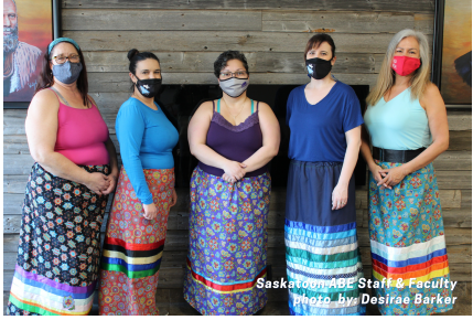
GDI COMMUNICATOR - PAGE 4